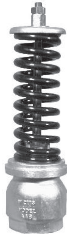
Factory set and sealed or shipped for field setting